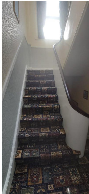
To Rooms 9/10, 11