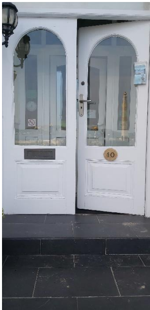
Front Double Doors