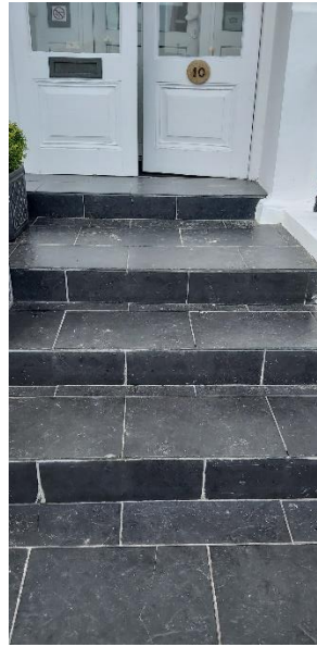
Steps to Front Door