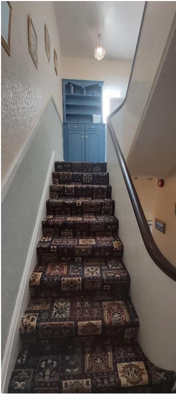
To Rooms 6, 7, 8