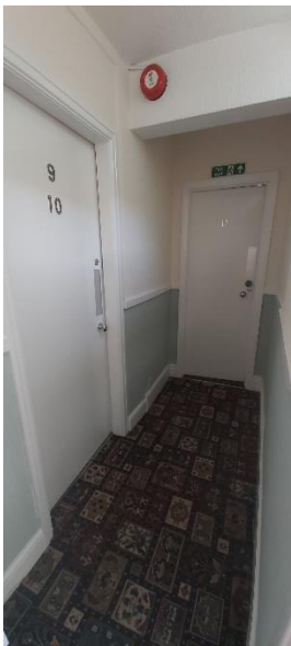
Rooms 9/10, 11