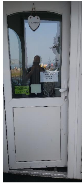
Self Closing Door