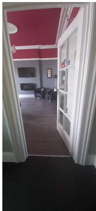
Honesty Bar / Lounge