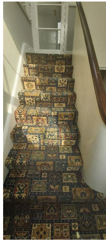
Final Door to 9/10, 11