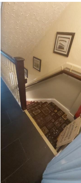
From Reception Hall