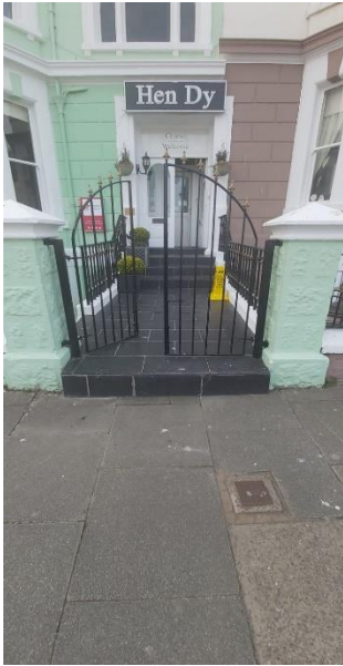
From North Parade